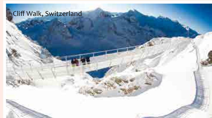
Cliff Walk, Switzerland

Due to operational reasons, the routing of this tour may be changed. However all the sightseeing will remain the same.