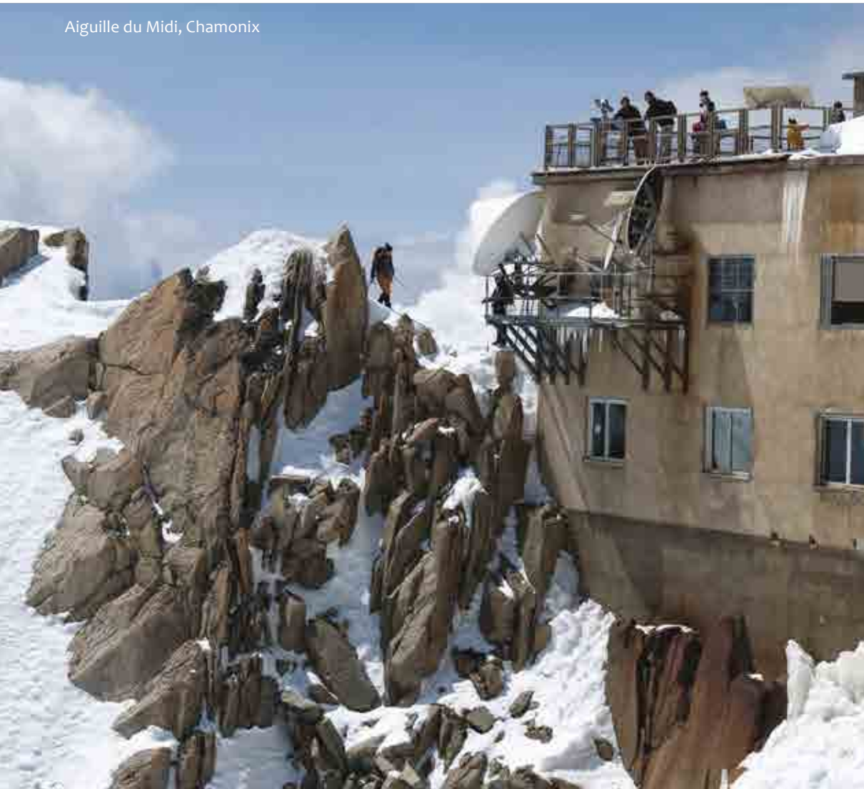
Aiguille du Midi, Chamonix