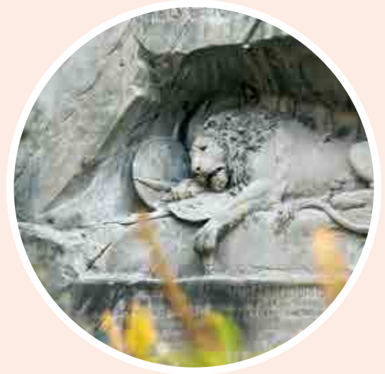
Lion Monument, Lucerne